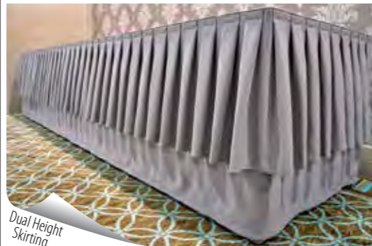
Dual Height Skirting

Evento also provides a wide range of colours and fabric types to meet our client's specific decoration requirements.