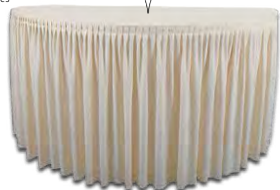
Table Cover Plisse (top cloth & Skirting stitched together)