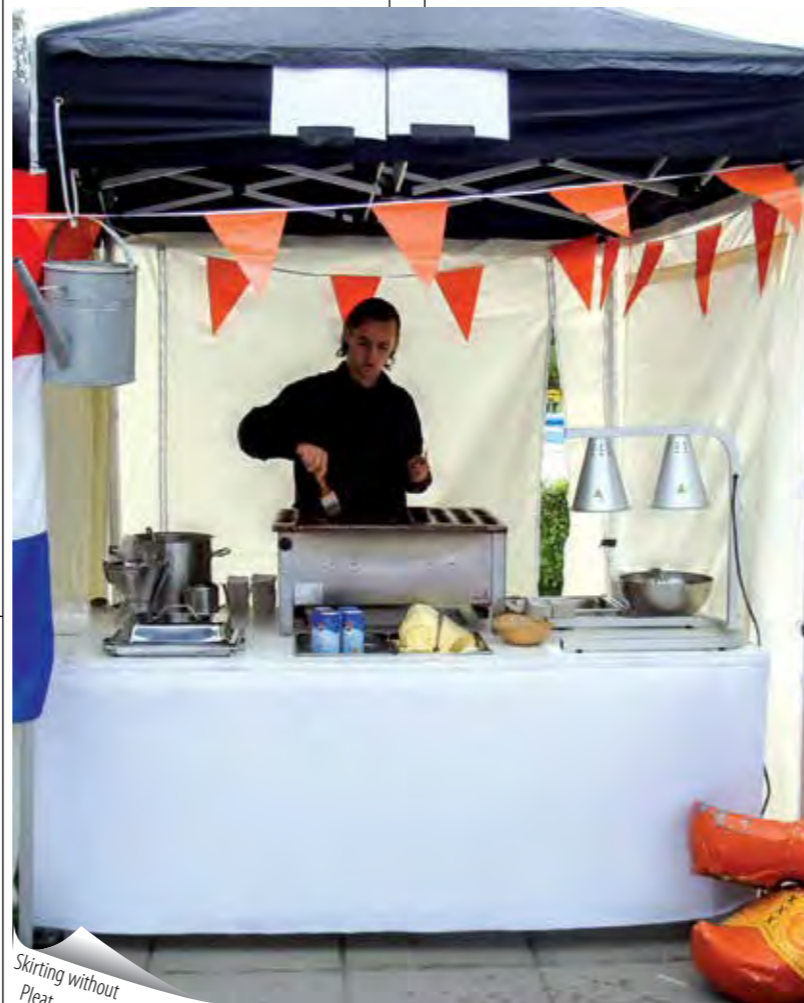
Skirting without Pleat