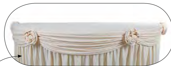
Valance with rosettes