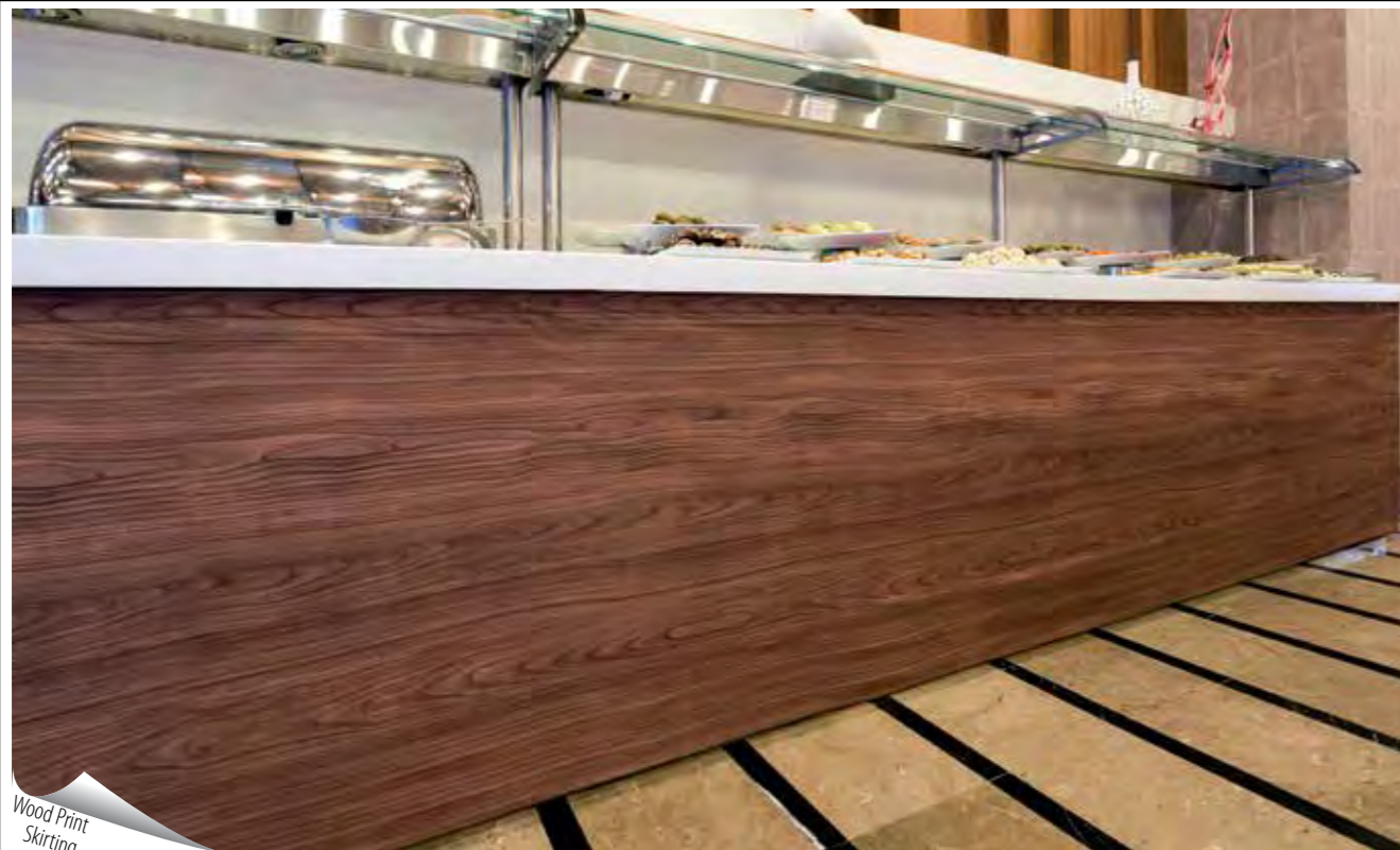
Wood Print Skirting