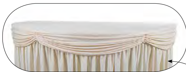
Valance without rosettes